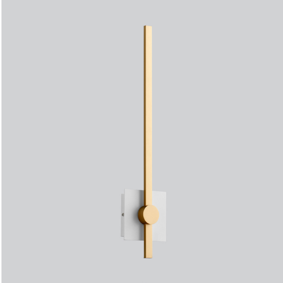
-650 White/Industrial Brass